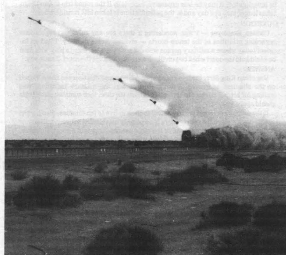
FOUR ZUNI ROCKETS are launched from a sled on NWC's Supersonic Naval Ordnance Research Track (SNORT).

China Lake police were called to keep the peace and break up the disturbance.