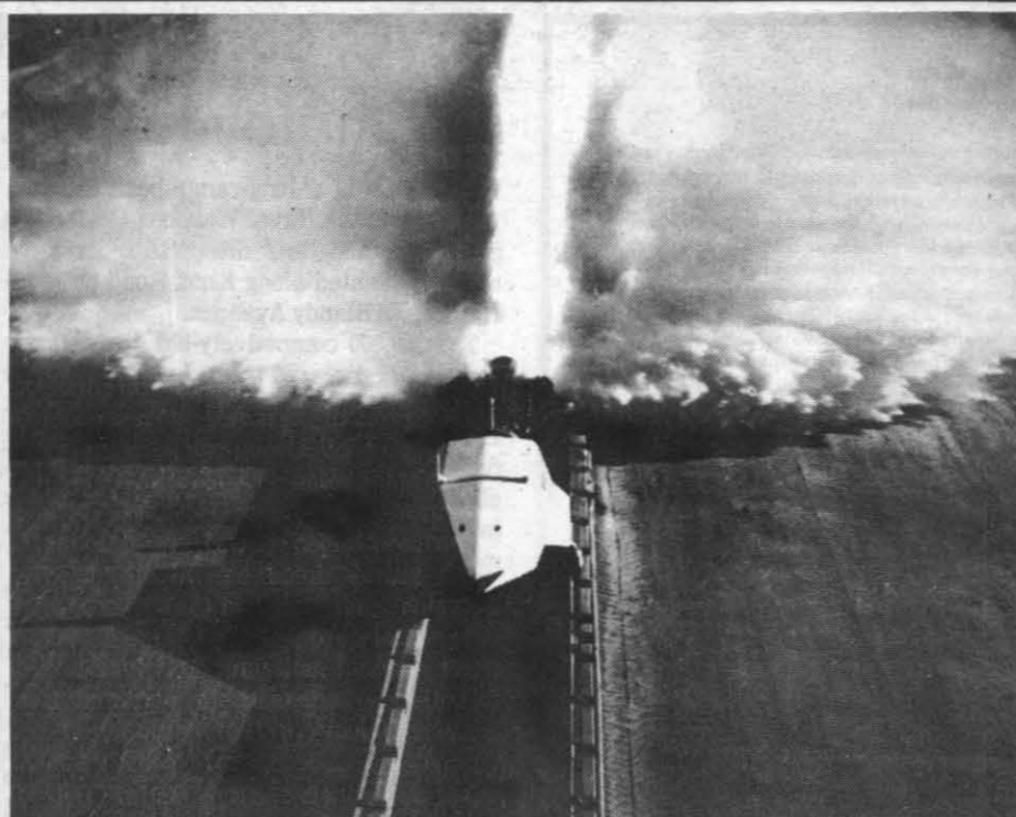
DRAMATIC EFFECT — A probe beneath the rocket sled dragging through water slows the rocket sled down as it nears the end of the Supersonic Naval Ordnance Research Track.