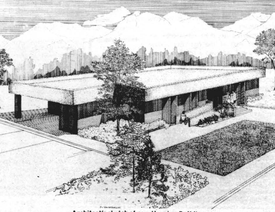
Architect's sketch of new Housing Building

He warned that the isolationism that some conflicts is no longer practical. In the event