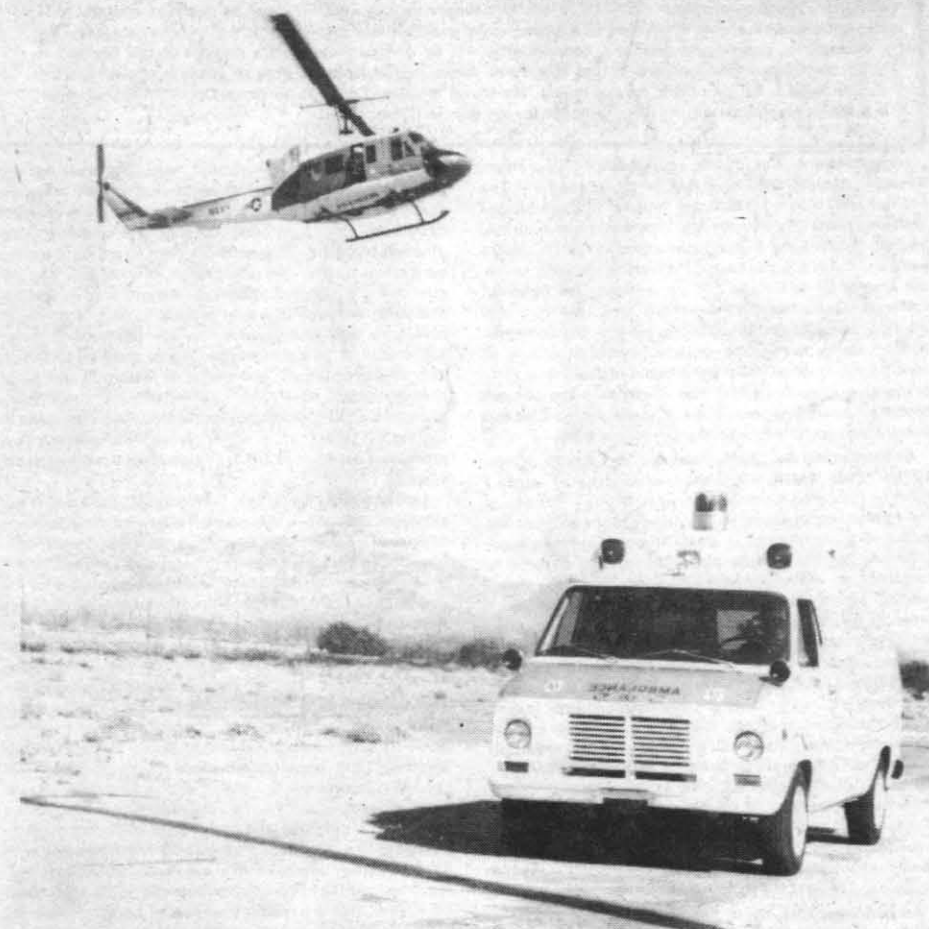
EVACUATION PRACTICE — During a recent crash drill, the SAR helo flew "victims" to the heliport near the Ridgecrest Community Hospital where, with the assistance of ambulance crews, they could be taken to the hospital for care. The helo also landed on the front lawn of the NRMC branch clinic at China Lake to bring in the "injured" for care during the practice exercise.