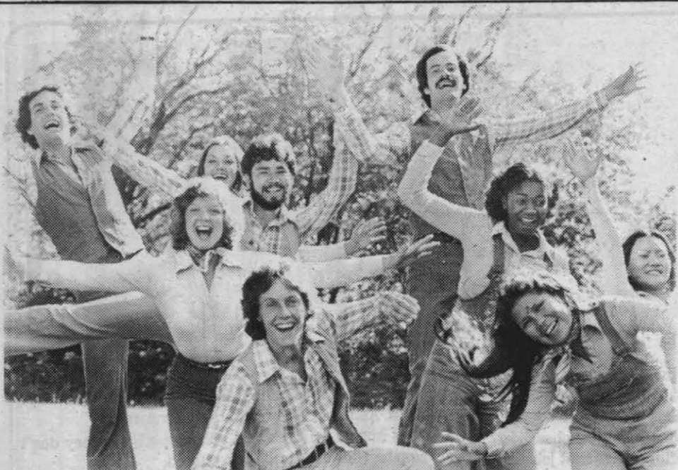
A RETURN ENGAGEMENT — "Up With People" will be appearing at the NWC Theater on Saturday, Feb. 3, in a return engagement at China Lake. The cast of about 75 singers, dancers and musicians made their first appearance here in September 1976 to a "standing room only" audience. Members of the cast represent a cross section of race, background, religion and culture.