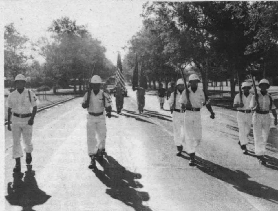
FLAG DAY PARADE HELD — The Bicentennial of the adoption of the flag of the United States by the Continental Congress was observed locally by a parade along Blandy Ave. on Tuesday morning, as well as by the traditional Flag Day ceremony held that evening at the Ridgecrest Elks Lodge. Participants in the parade, which was led by the Naval Weapons Center color guard and drill team, included color guards from the China Lake Police Division, VFW Ship 4084 and American Legion Post 684. On Tuesday in Washington, D.C., the Department of Defense formally dedicated a "flag corridor" in which are displayed the American flag, state and territorial flags, and a series of flags that depict the evolution of the American flag from the English flag that flew over Jamestown in 1607 up until the present time.

Members of the Blue Eagles presented a pageant of American flags that have flown at various times in this nation's history, coupled with narration about each of the flags by M/Sgt. Des Jardins, who is in