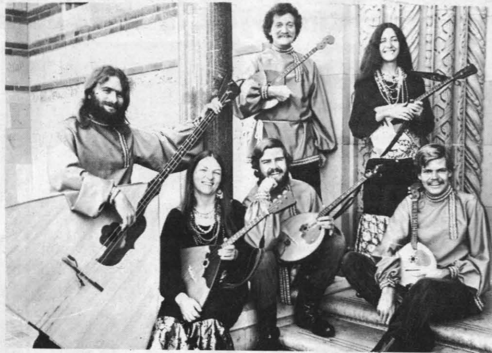
RUSSIAN FOLK MUSIC CONCERT — The Odessa Balalaikas will present a concert of Russian and Slavic folk and gypsy music next Friday, Aug. 29, at the Cerro Coso College Lecture Hall. The group takes its name from the authentic Russian stringed instruments each member holds.

The VA urged any veteran who wishes to check on or change his beneficiary to contact the VA insurance center to which he pays his premiums—either in Philadelphia or St. Paul. The veteran should be sure to provide as much information as possible, including policy number, full name and address, the agency said.