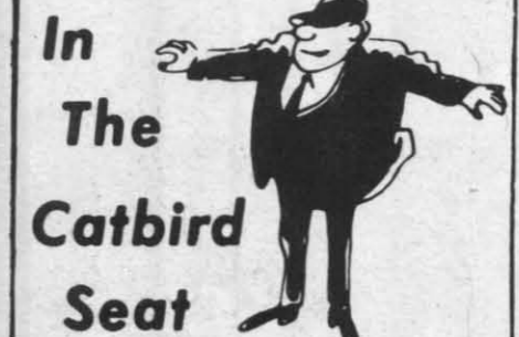
By Jack Lindsey

The 1975 Fast Pitch Division of the China Lake Intramural Softball League will wrap up play next week.