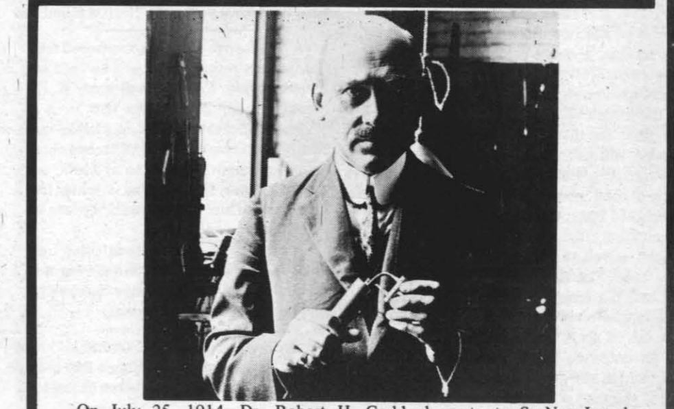
On July 25, 1914, Dr. Robert H. Goddard wrote to SecNav Josephus Daniels proposing a "Rocket Apparatus" with which to attack airplanes.

These important events in the history of the U.S. Navy are recounted here for the purpose of calling attention to the U.S. Navy's 200th birthday on Oct. 13, 1975, as the entire nation prepares for the Bicentennial observance during the year 1976.