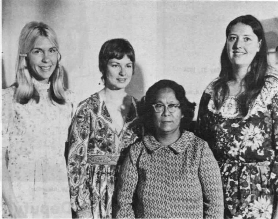
AAUW OFFICERS INSTALLED — The American Association of University Women recently installed a new slate of officers during a banquet held at the Commissioned Officers' Mess.