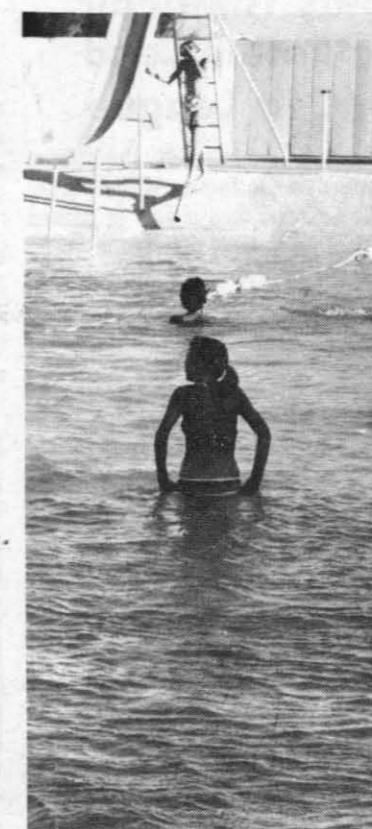
The Junior High School sessions, held in the evenings, were active, busy meetings. A swim party and barbecue held at the NAF swimming pool on the last night of Ecumenical Bible School, brought the group together in fellowship with a songfest after swimming and the evening meal.