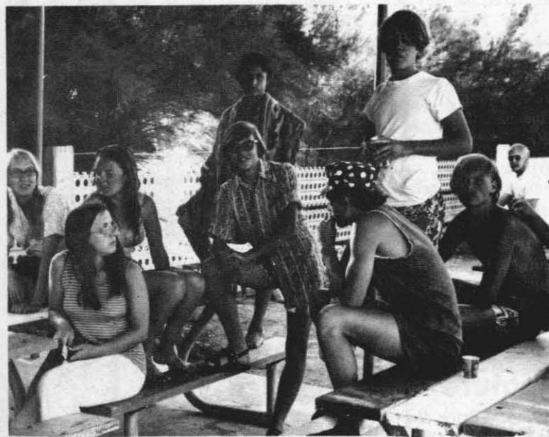
The Recreation Crew—Teenage helpers for the Ecumenical Bible School, held their own swim party and barbecue at the NAF swimming pool relaxing after a busy day with the elementary children. The help these people gave during Bible school sessions cannot be measured by those unable to see the group in action.