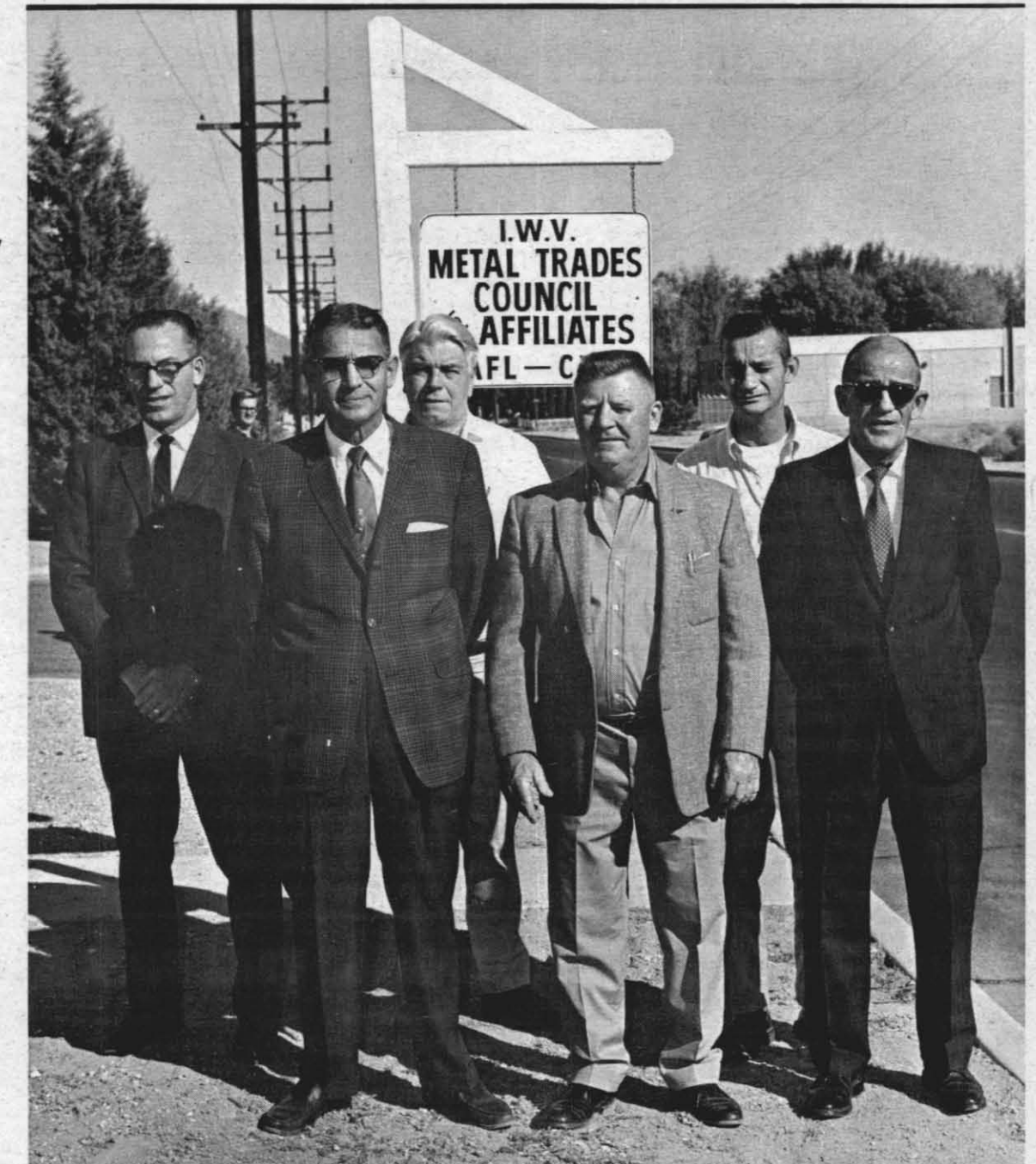
TRADES COUNCIL OPENS OFFICE — The officers of the I.W.V. Metal Trades Council gather in front of the Council's new office, located at 65-B Halsey, on the Center. The Council holds exclusive recognition for all ungraded employees in the Unit on the Center. Hours of operation at the new office are 7:30 p.m. until 9:30 p.m., Monday through Friday.