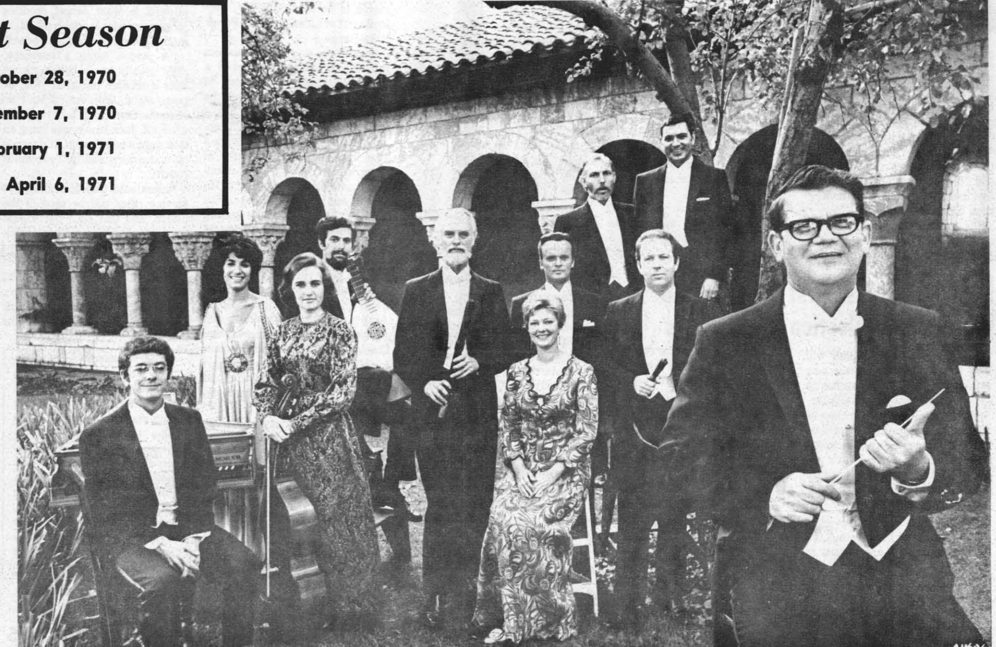
THE NEW YORK PRO MUSICA