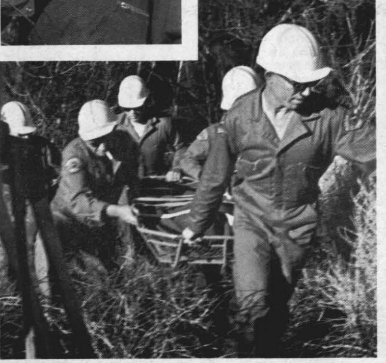
RUGGED TRIP - Just finding the victim is a long way from the end of the operation. Bringing him out safely is something else altogether. Here you see five of the team using a special basket stretcher and going through some pretty rough