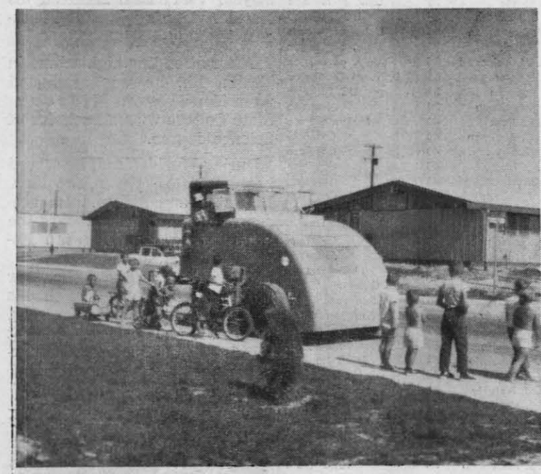
DANGEROUS PLAY — These China Lake children clustered around a street sweeper are courting disaster. According to Safety officials, the wire brooms could not be stopped in time by the operator to keep a child from being swept to death in the machine.