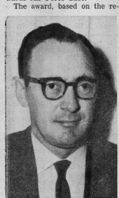
... earns recognition