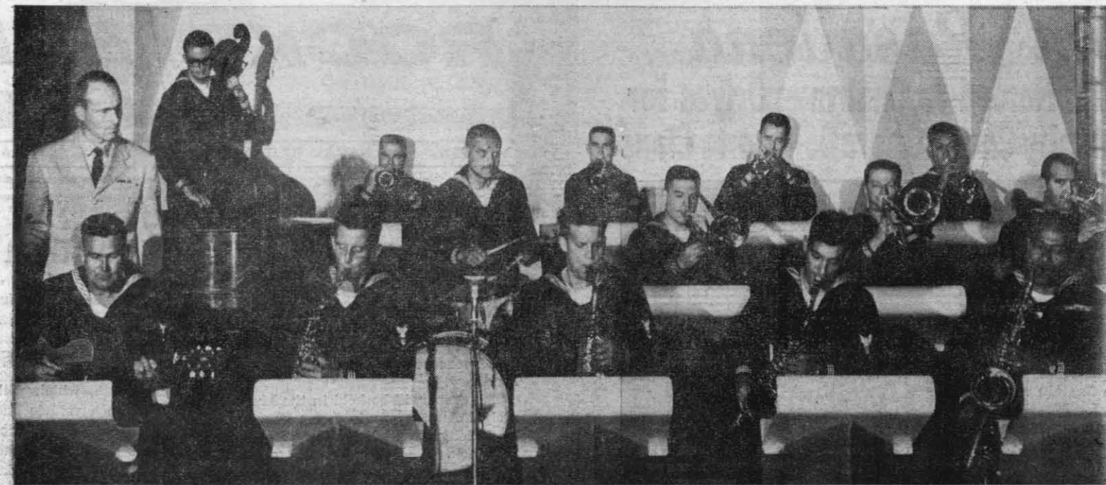
PERFORMING TONIGHT —Appearance of the rhythmical ComCruDesPac Band at the Community Center always evokes a spirited evening. Dancing begins at 9 p.m., and reservations will be held only till 9:30.

Military dependents requesting medical care at the Station Hospital are now required to make appointments. Available hours are from 1 to 4 p.m. each Monday, Wednesday, and Friday. Appointments can be scheduled by calling Ext. 72911, 72912, or 72913. The complete film program for each Saturday will be published in the "Showboat" section of the Rocketeer. Emergency cases will be admitted at any time.