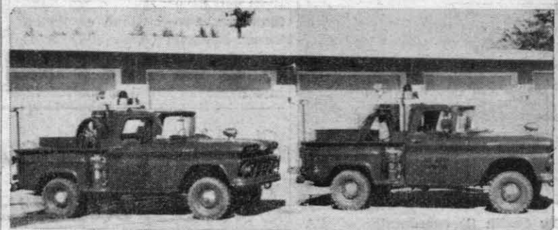
NEW EQUIPMENT — Pictured here are two of three new vehicles recently acquired by the NOTS Fire Branch. The other vehicle, also a 1/2 ton pickup, is located at the Naval Air Facility. These serve as control cars for the Fire Officers and as auxiliary crash fire equipment.