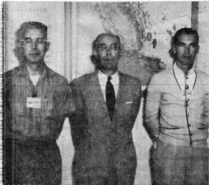
FEDERAL AWARD — Three Aviation Ordnance Department employees received Federal Service pins in recognition of their individual twenty-year service record.