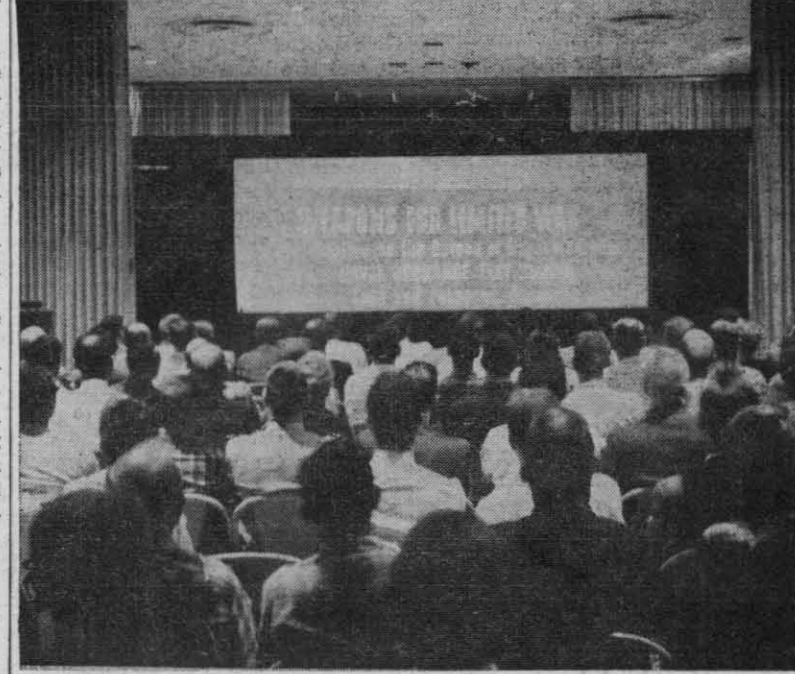
TIMELY SUBJECT —An engrossed audience view the latest NOTS presentation entitled "Weapons for Limited War" shown this week for China Lake and Pasadena personnel. The initial release, presented to top military and government officials at Washington, D.C. created a great deal of interest which resulted in requests for repeat showings.