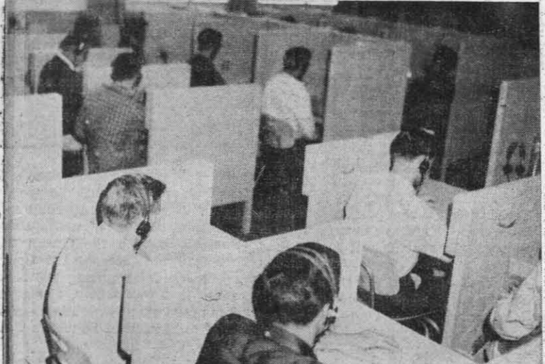
justable depending on the type of assignment students have been given. marines. Foreground shows panels collapsed for open instruction. Background shows raised panels for individual assignments blocking out noise and er must close within a few hundred distractions.