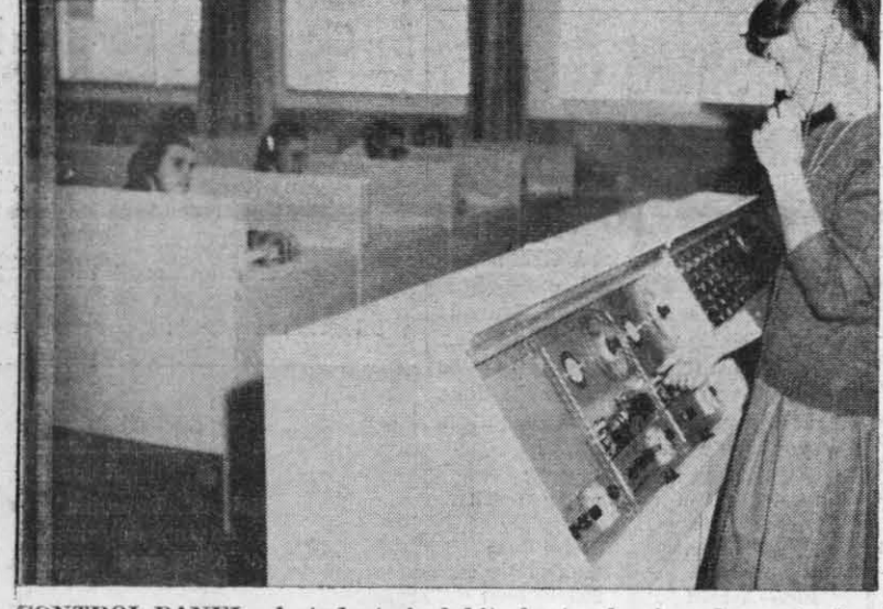
CONTROL PANEL-A student pinch hits for teacher in a demonstration of the mechanics of the control panel. The central switchboard permits Now Operationa unication between teacher and individual student stations.

"I therefore propose formation of a 'peace corps' of talented young men willing to serve their country, as technicians, for three years as an alternative to peacetime selective service. They must be qualified through rigorous standards, and trained in the language, skills, and customs of the country where they will serve."