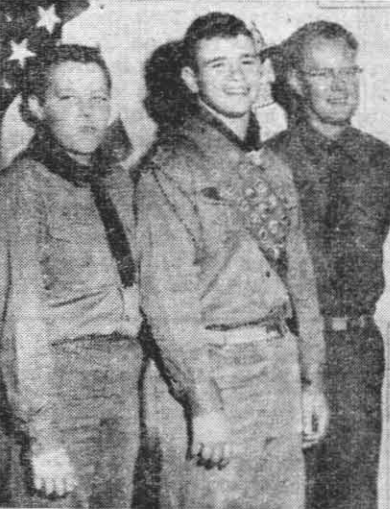
DUAL ACHIEVEMENT—Candidates for the God and Country Award must not only achieve the rank of First Class but also fulfill one year of service to his church.

will meet Wednesday, November 16, at 7 p.m. at James Monroe School in Ridgecrest.