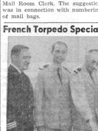
CONFERENCE—During three-day tour here last week, French visitors point out their home station.