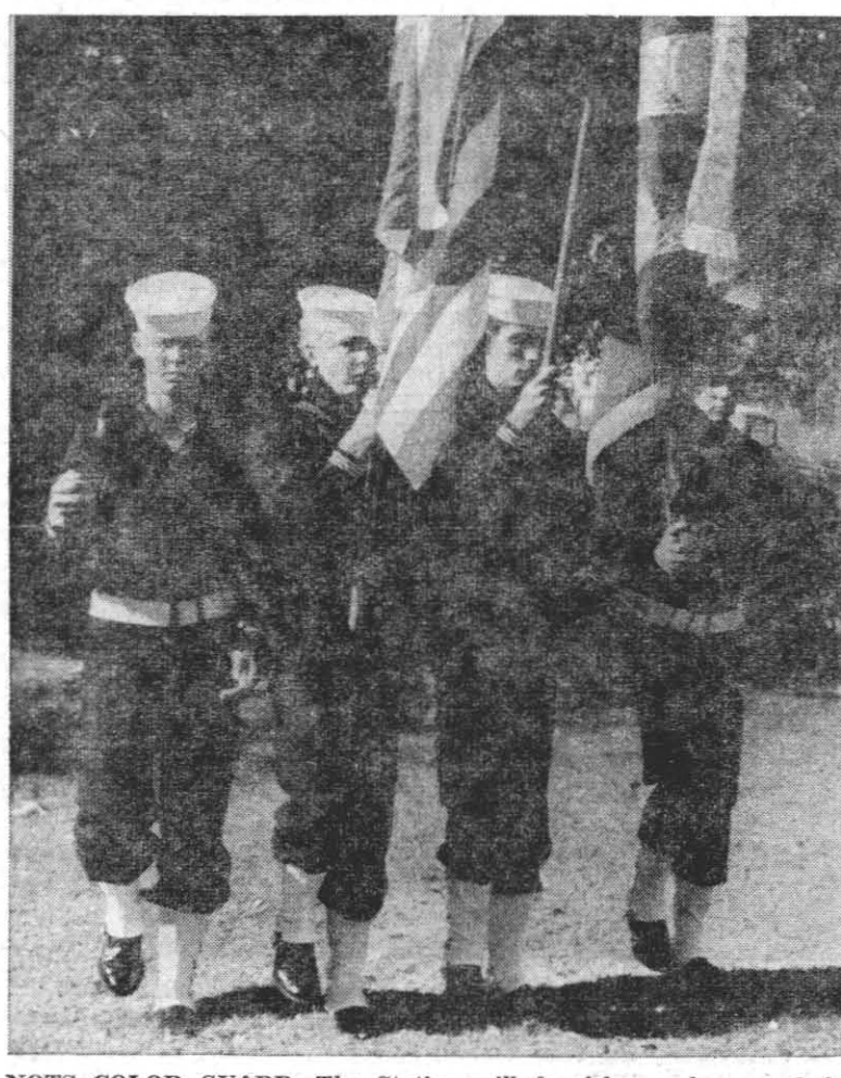
NOTS COLOR GUARD—The Station will furnish a color guard for Veterans Day services to be held Friday at Scotty's Castle during the 11th annual encampment of the Death Valley 49ers.