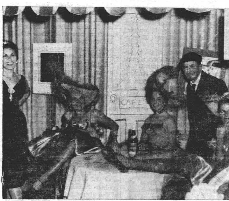
ARTY PARTY—These "sketch artists" are a portion of the entertainers who contributed to the Desert Art League's colorful third annual party.