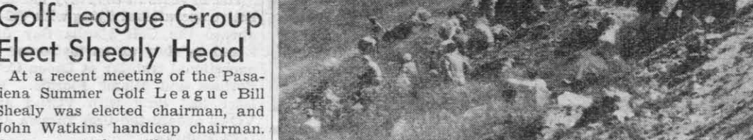
FIRING DAY—More than 80 representatives of press, radio, and television await countdown for Polaris firing at San Clemente Island on April 14. See details of story on page 1.