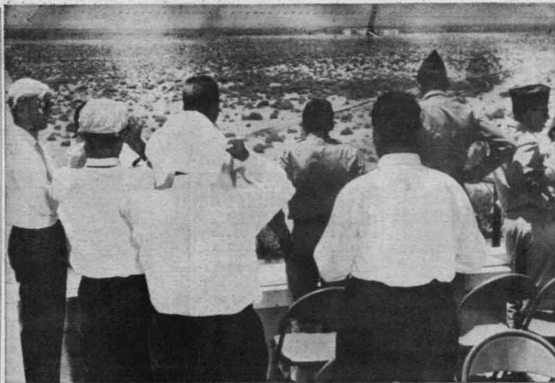
BEATING THE HEAT —Four of the seven representatives from the Aero Club of Switzerland who visited the Station last Tuesday are pictured as they observe a test at C-3 Range. Uniformed youngsters are CAP Cadets from CAP Squadron 66, Bishop.

acting as hosts to the visitors during their eight days in this region. The Swiss cadets are all glider pilots, ranging in age from 21 to 23, and they have spent several days in glider flights. The quaint headgear is emergency protection against the torrid sun.