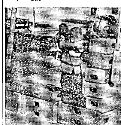
FUN-TIME—Hollow blocks (left) build an airplane against a background of a party, small-boy style, and