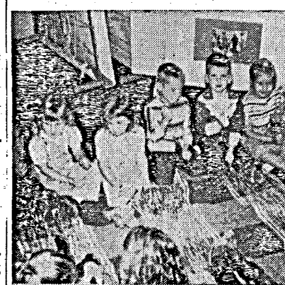
SMALL-FRY JOYS—Story-time is a quiet time as each day is, the youngsters, tired and content, like the Nursery and an activity enjoyed by all. Enjoyable