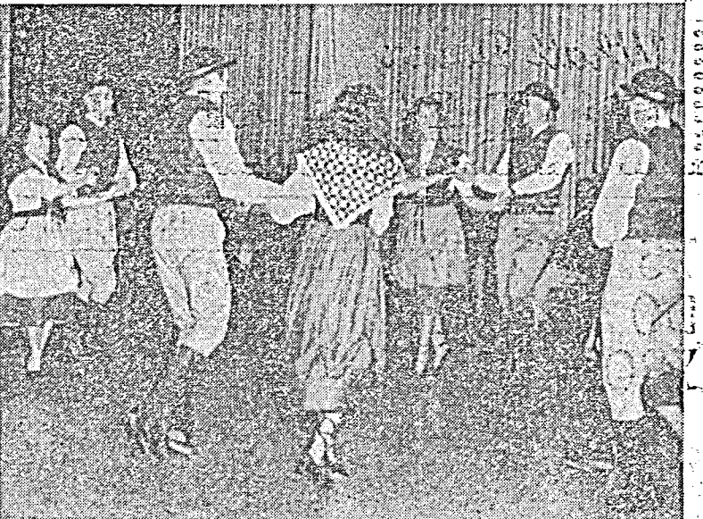
'ERIN GO BRATH'—Local dancers in Irish costumes go through their dances which must have made many an Irish heart long for the old sod at the Adult dance held in the Community Center last Friday night.

Community Center Coffee Shop Open Monday through Friday—1 p.m. to 11 p.m. Open Saturdays, Sundays and Holidays—7 a.m. to 11 p.m. The new schedule moves the breakfast service on weekends from the Station Restaurant to the Coffee Shop.