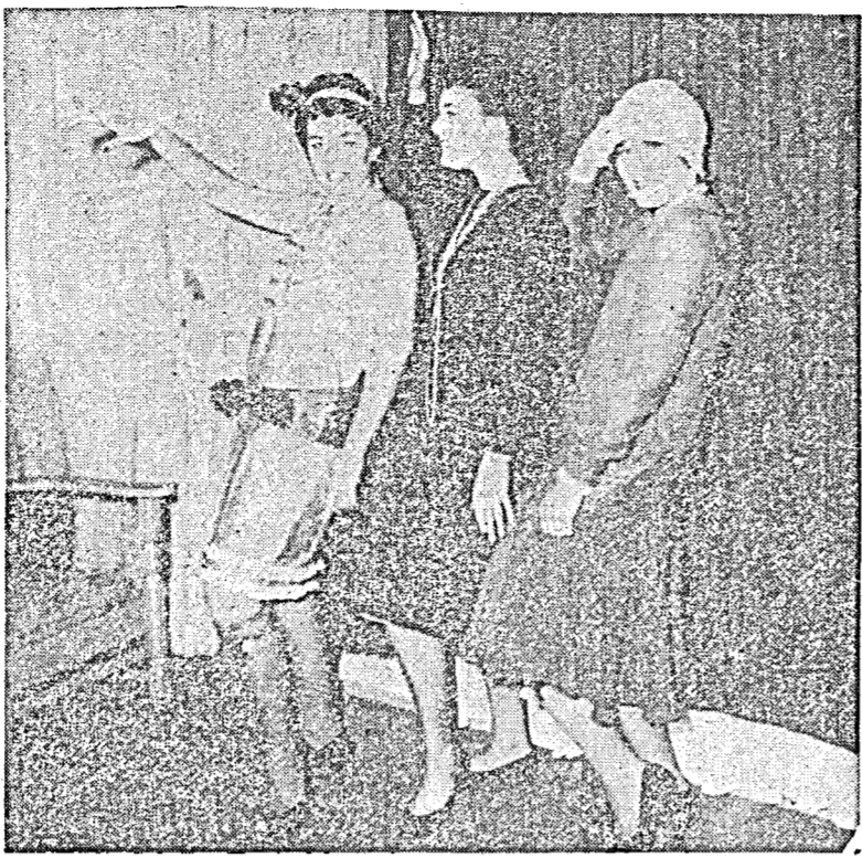
HEY! HEY!—Burroughs High School seniors make "Hey!" on "Hard Times Day," the last day of school for mid-term graduates.

The speed of these cars are 151.26 and 147.54 miles per hour, respectively.