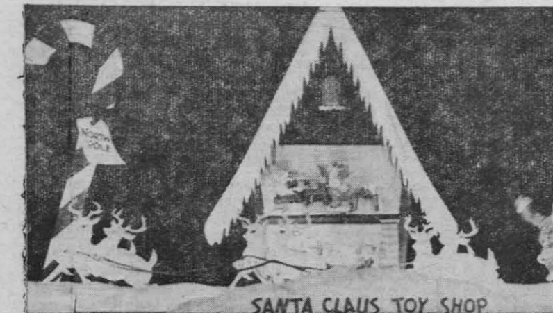
SANTA'S WORK SHOP—Highlighted annually is the Christmas scene created by the Station's firefighters which adorns the roof of the fire station. The holiday project is a year 'round hobby for the firefighters.