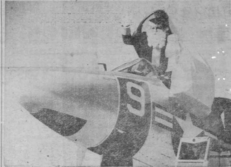
SUPERSONIC REINDEER—Santa Claus climbs out of a high-velocity sleigh at the NAF and VX-5 Christmas party. The party took place in Hangar 1 of the Air Facility and was attended by more than 250 children. Santa is shown climbing out of an A4D Skyhawk.