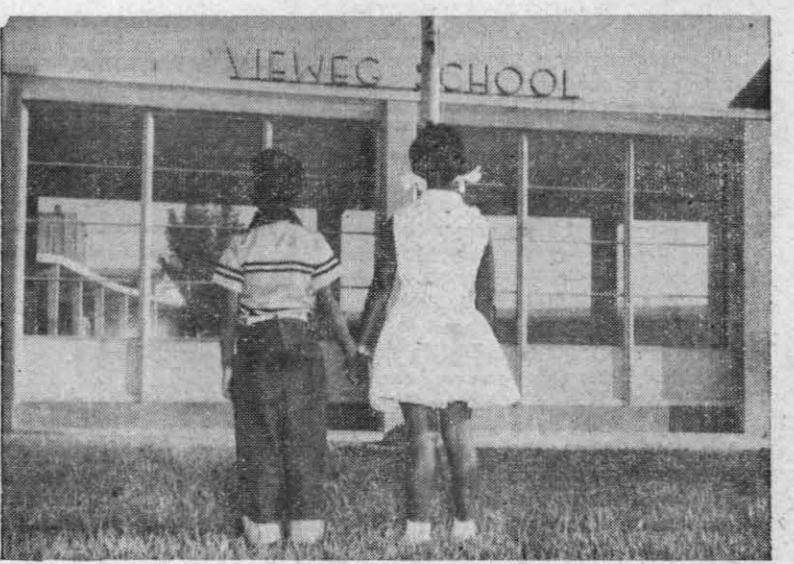
ing Tuesday, September 25, at the every Tuesday, Wednesday and comers in the primary grades at Vieweg school studying the impressive school and presently the site of the first regular membership meeting Thursday nights. "If you want to building where they will spend many hours during the coming year.