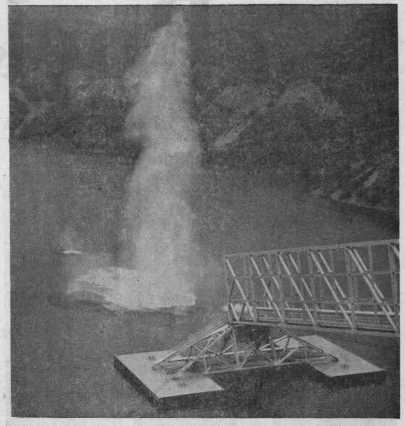
NOTS' VARIABLE ANGLE LAUNCHER at Morris Dam, north of Azusa, will be described in a new documentary motion picture to be shown at the Station theatre on Sunday and Monday, April 22 and 23.

Submarine nets are made of thousands of intertwined steel rings called "grommets," about 16 inches