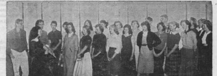
TWENTY-NINE Novitiate members accepted in scholastic chapter here.